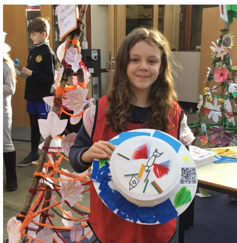
Year 4 Bubble