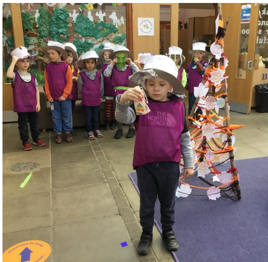
Year 1 Bubble