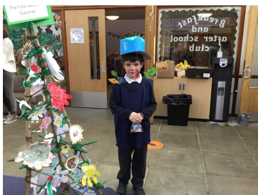
Year 5 Bubble