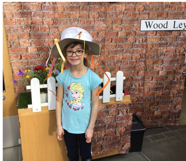
Year 2 Bubble