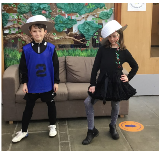
Year 3 Bubble