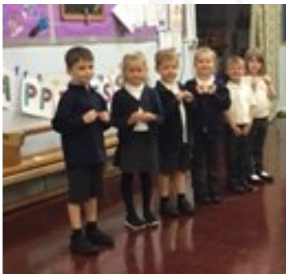
KS1 School Councillors