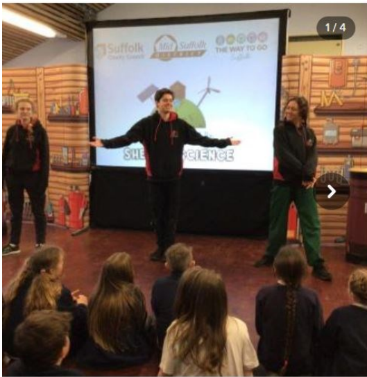
Year 5 Science Workshop with a visiting theatre group