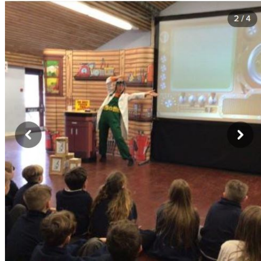
Year 6 Children experienced an inspirational workshop from Windrush visitors