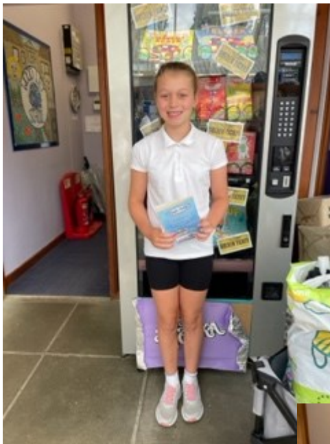
Summer Term 2023 KS2