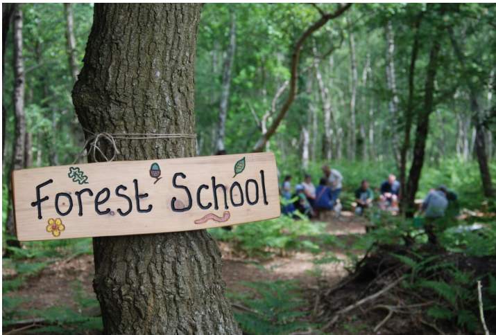
KS1 and Foundation classes enjoying forest School Activities