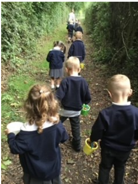
Foundation classes enjoying our new little Wandle reading books.