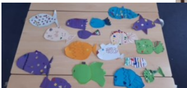
KS1 painting and decorating fish