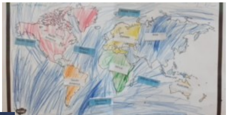
KS1 children have been learning to name the seven continents and the five oceans.