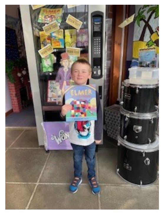
Golden Ticket Winners for Demonstrating Resilience