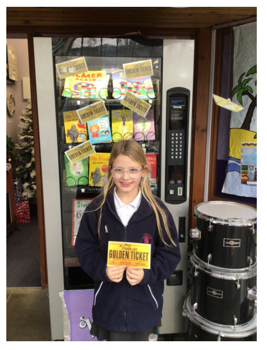
Golden Ticket Winners for Demonstrating Resilience